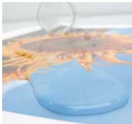
Spilled water just pools on plastic paper

Polyester paper is available through Headley Brothers (Digital). To find out more, call our sales team on 01233 623131.