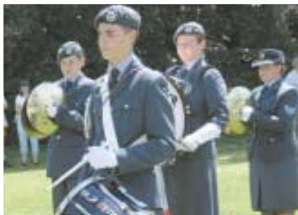
Rousing tunes courtesy of the Ashford Air Cadet band

Punch and Judy, face painting and a bouncy castle kept the children happy, while the crowds enjoyed a performance from the local Air Cadet band before watching England's first World Cup group match against Paraguay on the big screen in the marquee. The hot, sunny weather meant that the ice cream van (and bar!) did a roaring trade, and there was a free afternoon tea for all who attended.