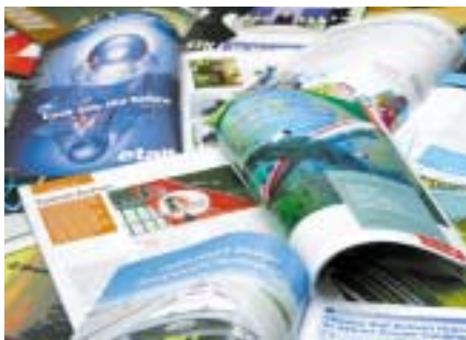
Colour guides for each publication aid in meeting and exceeding colour expectations on a consistent basis

Many of the titles we currently print have very tight deadlines, and files arrive (digitally) to pre-press very close to their production slot, without accompanying colour guides. In order to adhere to the production schedule, we have found that this can result in plates reaching the pressroom without any colour reference material.