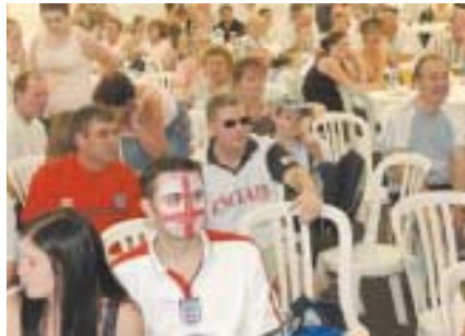
Football fans gathered to watch England vs Paraguay

The evening 'do' was very enjoyable and great fun, thanks to the highly entertaining and very talented musical comedy tribute act 'Frank 'n' Stein', who imitated a wide range of well known pop acts from Elvis and the Beatles to Tom Jones and Oasis.