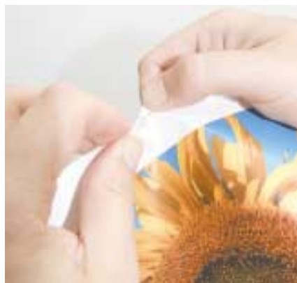
One of our sales team tries to tear plastic paper