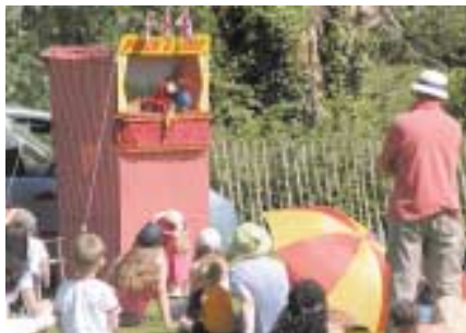
Kids were fascinated by the traditional puppet show

On 10th June, Headley Brothers celebrated 125 years in the printing business with a party for staff and their families at the company's Queen's Road site in Ashford – and managed to raise over £2000 for charity at the same time! Guests were invited to take a tour around the factory and try their luck with fairground games including a coconut shy, pitch and putt, spinning wheel and bowling.