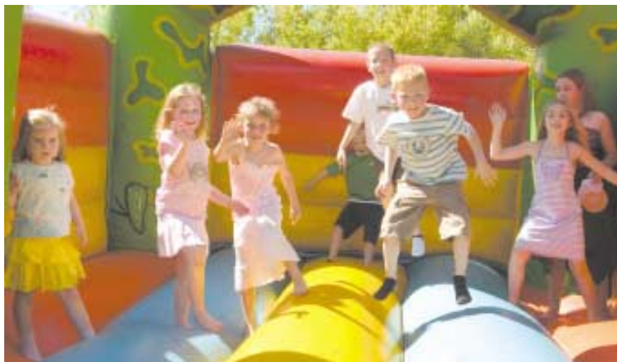
Some of Headley Brother's youngest guests at the Open Day having 'bouncing' good fun!

Let Headley Brothers (Digital) personalise your marketing material or magazine front cover and you could increase response rates up to 500%