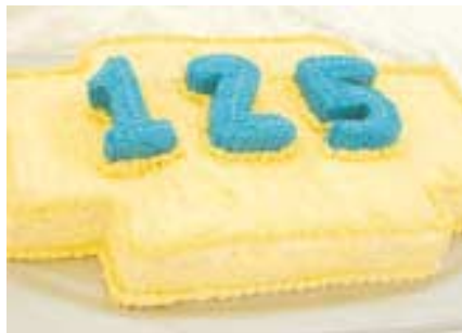
Celebratory cake presented to the board of directors

There were some great prizes up for grabs in the raffle (all generously donated by Headley Brothers' suppliers), including cases of wine, Charlton FC football tickets, a sandwich toaster, chocolates, whiskey, golfer's goody bags, champagne and the star prize – a tv/dvd. The sale of raffle tickets contributed over £500 to the fundraising effort.