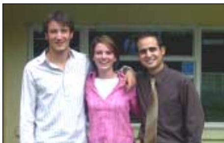
Students from Germany staying at Headley Brothers this summer

Internships and practical experience are obligatory at the school, and every student has to stay two terms of half year